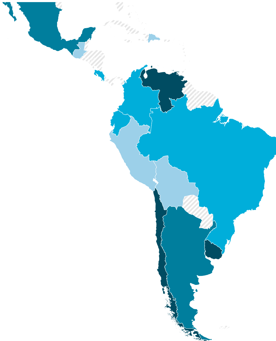
Labour Productivity 2013 Latin America (forecasts) (GDP US$ per person employed)